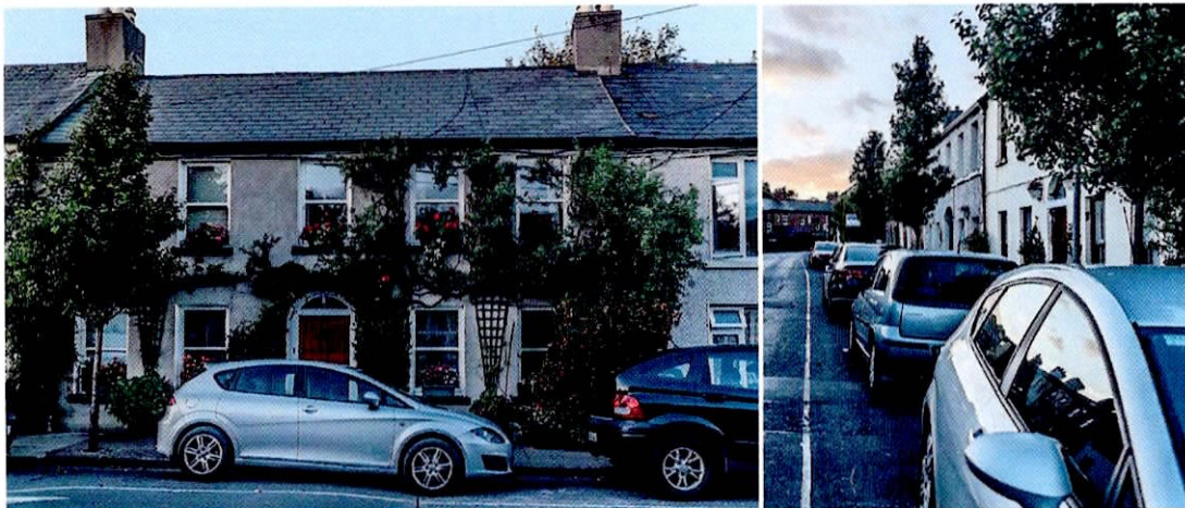
Images of community improvements & environmental efforts of upgrade, Monck Place

Bus Connects is a significant infrastructural project that has a clear logic to induce a more sustainable urban transport modal shift. I support the decarbonising of movement for the City's residents. In this observation I note that in tandem with the wider Bus Connects Objective, the protection and improvement of quality of local environments that are affected by the Bus Connects scheme is also paramount. Both objectives are mutually compatible and I support how the Bus Connects plan has managed these resolution of both as the relate to my local area.