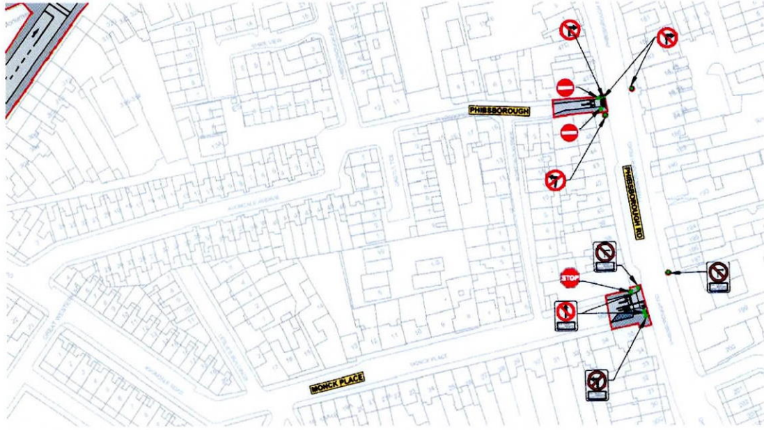
Extract of Bus Connects Plan to restrict traffic flow at Phibsborough Road, Monck Place & Avondale Avenue ('Phibsborough')

The roads at Monck Place, Avondale Road & Avondale Avenue have now been included in the Bus Connects scope of application, with proposed traffic movement restrictions now applied to these roads to prevent the future misuse of these roads for rat-running traffic: